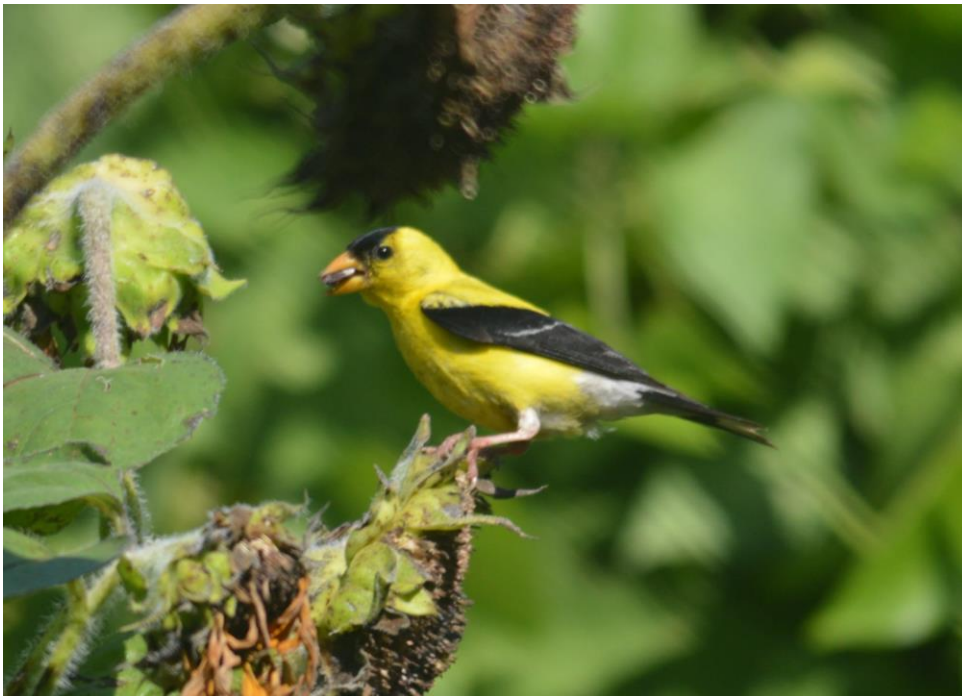
A goldfinch perched on one of our sunflower heads, eating the ripened seeds.